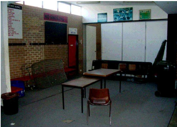
Club Rooms (Home): Advertising can be placed on the white walls, and/or the blackboard under the “no smoking” sign. (Match Day Sponsors, Platinum Sponsors, Gold Sponsors, Silver Sponsors, Bronze Sponsors)