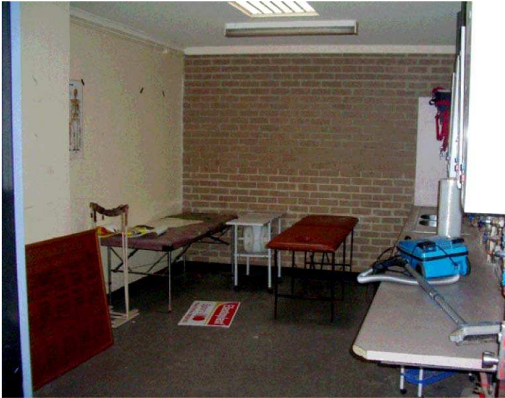
Physio Rooms: Advertising can be placed on the back wall. (Match Day Sponsors, Platinum Sponsors, Gold Sponsors, Silver Sponsors, Bronze Sponsors)