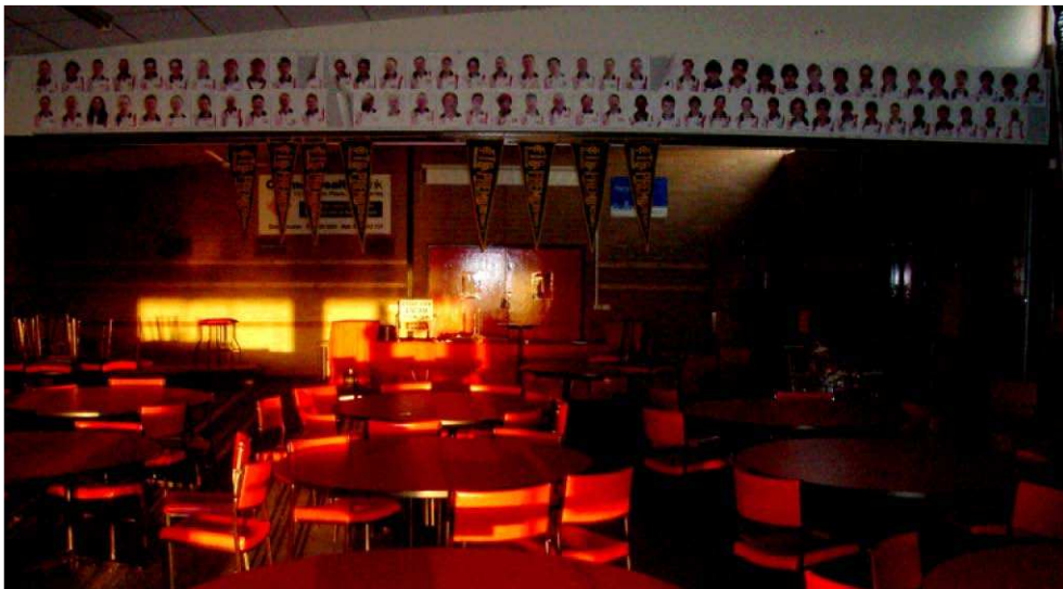
Social Room: Signage for player sponsors featured under the photo of the player sponsored. Other sponsors can also capitalise on having signage along the back wall. (Business Card Sponsors, Player Sponsors, Match Day Sponsors, Platinum Sponsors, Gold Sponsors, Silver Sponsors, Bronze Sponsors)