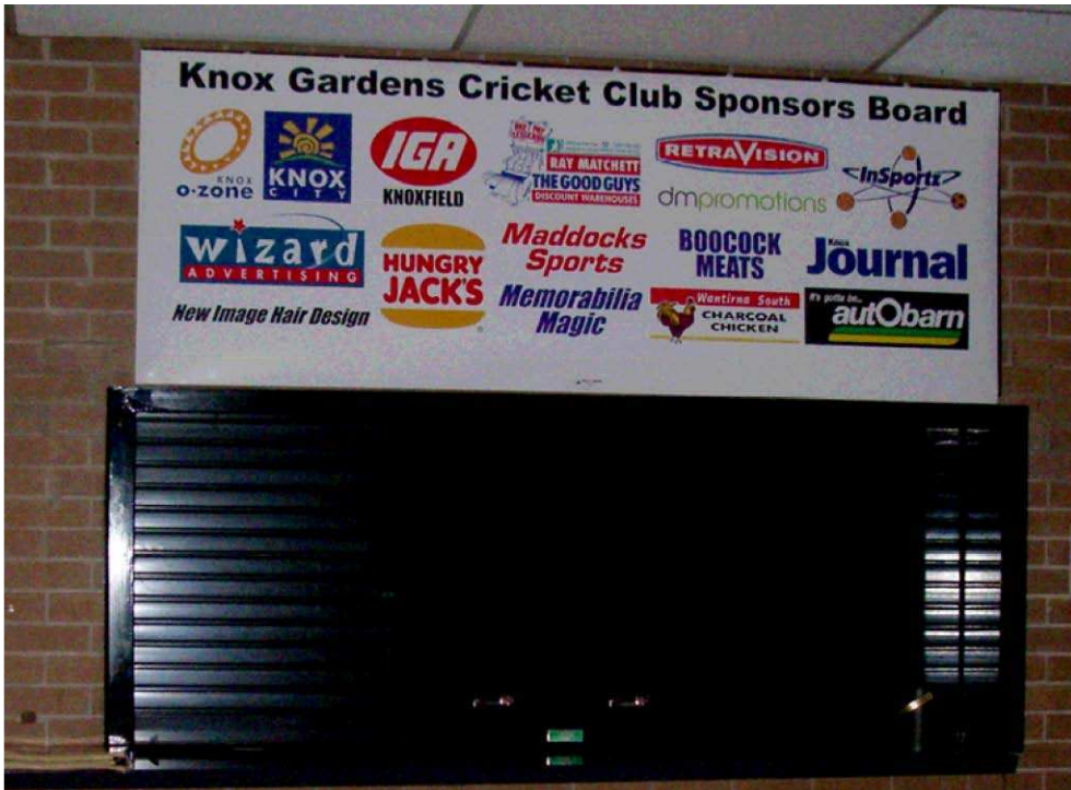
Canteen inside the clubrooms: Signage can be situated on top of the canteen window as shown in the window above. (Match Day Sponsors, Platinum Sponsors, Gold Sponsors, Silver Sponsors, Bronze Sponsors)